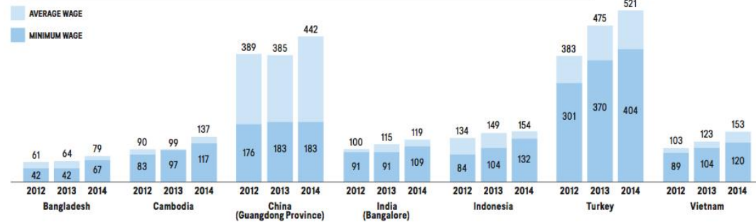
WAGE INCREASES IN % FROM 2012 TO 2014*